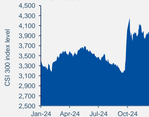
Markets in search for further upside potential in the Chinese stock market