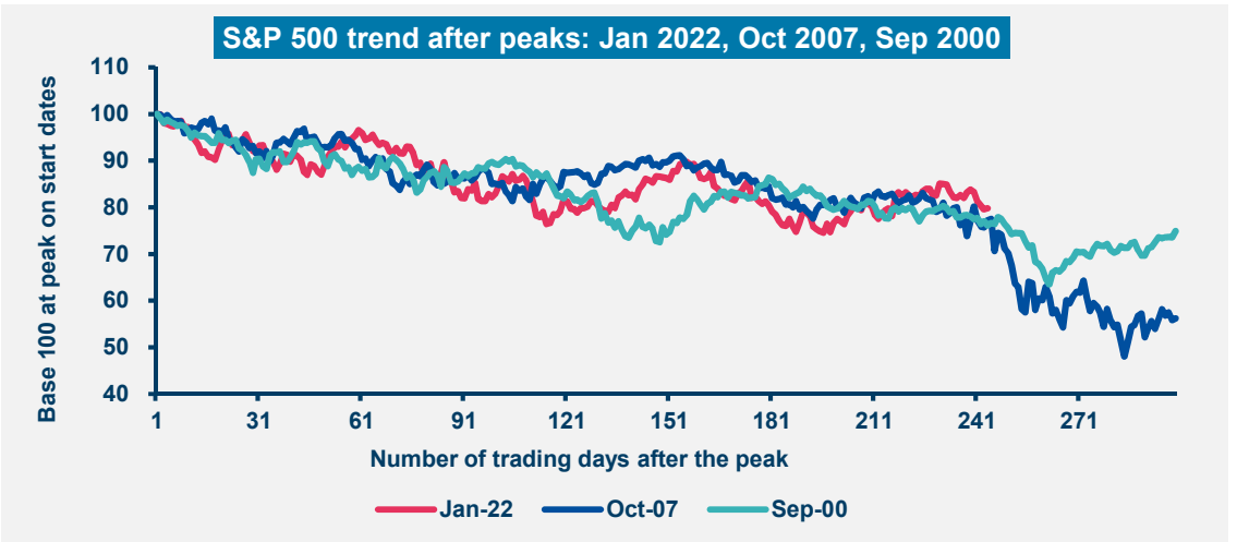
Data as of 20 December 2022. Starting point of 100 shows the peak for the index on January 2022, October 2007 and September 2000.

At a sector level, we prefer energy over materials, and favour real estate and consumer discretionary, especially in China amid the Covid policy-induced rebound.