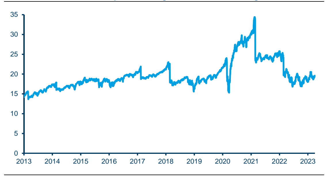
Exhibit 4: Twelve-month forward price-to-earnings ratios of S&P 500 Banking Sector

Source: Bloomberg, March 25, 2023. Last data point March 30, 2023.