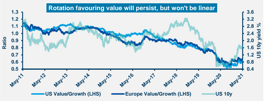
Russell 1000 Value, Russell 1000 Growth, MSCI Europe Value, MSCI Europe Growth.

Valuations are supported by economic recoveries and earnings improvements. However, geopolitical and idiosyncratic risks (Russia/Ukraine, LatAm protests, Asia regional tensions) need to be monitored. We favour value/cyclical stocks over growth amid expectations of a recovery. At a sector level, we are more positive on discretionary due to reopenings but less so on technology. On the other hand, we are more cautious on healthcare due to elevated valuations and remain defensive on consumer staples and Chinese financials.