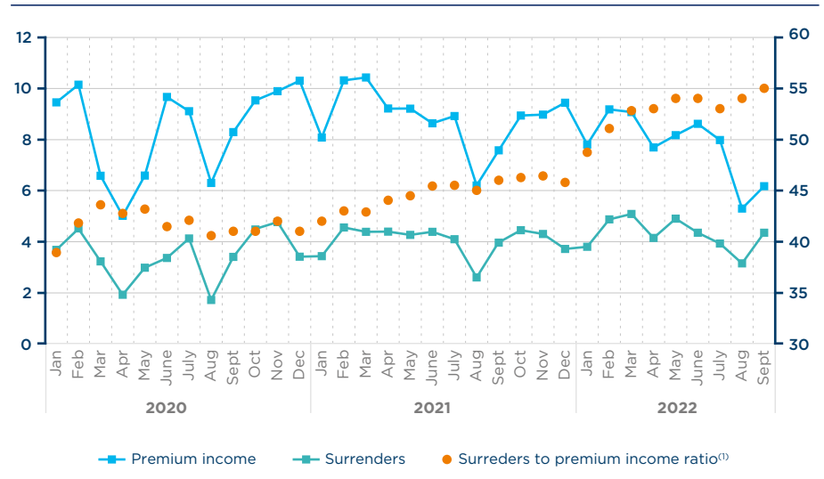
Figure 2 Ratio of surrenders to premium income of Italian insurance companies (monthly data, billions of euros and per cent)

Source: Institute for the Supervision of Insurance (in Italian Instituto per la vigilanza sulle assicurazioni also known as IVASS*). Extract from the November 2022 Financial Stability Report. For illustrative purpose only.