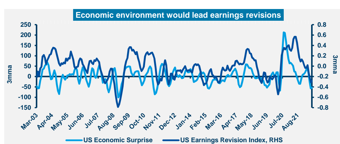
Source: Source: Amundi Institute, Bloomberg, as of 28 September 2022. Eco. surprise index = positive reading means data releases have been stronger than expected, whereas a negative number means data released has been worse than expected. 3 month moving averages shown above.

Geopolitical risks and uncertainty remain elevated, leading us to keep a cautious stance short term. However, the DM-EM growth differential and selectively attractive EM valuations are positive. We like Brazil and UAE while we are tactically neutral on China and are cautious on Turkish banks. At a sector level, we search for value names in discretionary segments (especially in China, given the expected rebound in domestic demand), and favour energy over materials.