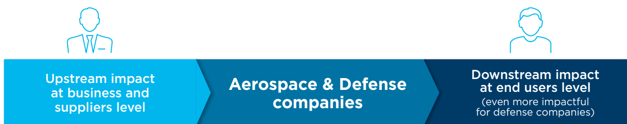
Figure 4 - The double materiality of aerospace & defence: potential human rights risks are both upstream and downstream