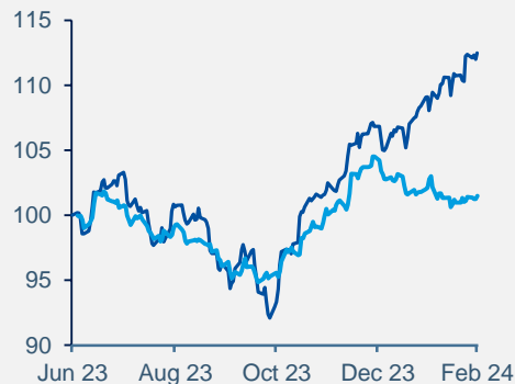
Growth and Fed expectations are driving bond and equity markets in different directions

— Global Equity — Global Bonds Base 100 at 30 June 2023.